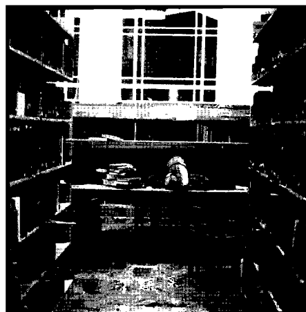
After Claude Cahun. Intervention #1.

The space of the library, then, consists of locating books in a coherent and totalizing classification system. The classification system is marginally flexible insofar as it can generally expand to accommodate new knowledges that emerge historically (e.g., Transsexuals ) but remains structurally limited ( Transsexuals must be embedded within the existing hierarchical and syndetic structure, and once placed there cannot be moved). This process produces a space that both disciplines and reflects reality. Foucault (1986, 27) articulates this geographic formation as a kind of heterotopia, with the role of the library being "to create a space that is other, another real space, as perfect, as meticulous, as well arranged as ours is messy, ill constructed, and jumbled... the heterotopia, not of illusion, but of compensation". Where material reality might be